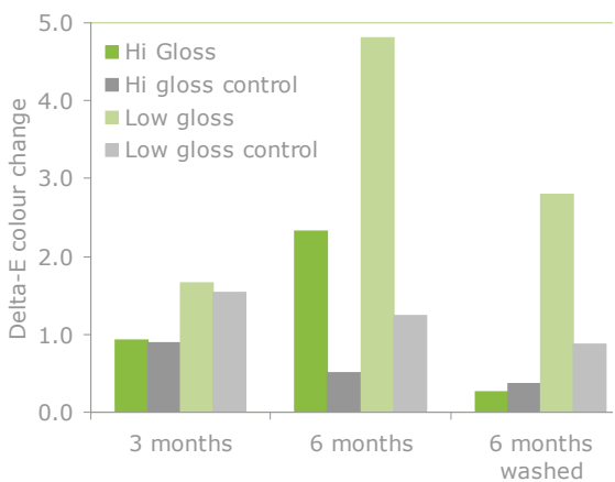
Fig. 3 - Gloss Changes For High & Low Gloss Products

to colour change rather than gloss reduction. This can be seen from Fig. 4 in which it is evident that both low and high gloss samples show significant colour change, particularly after 6 months of exposure, which is accelerated by the EN 13523-29 test conditions and the specified collector plate, when compared against the control samples. As expected, washing the samples minimises this colour change by removing loose dirt, but in this case, the low gloss samples can be seen to retain more dirt, even after washing, as shown by the greater colour change compared to the high gloss sample.